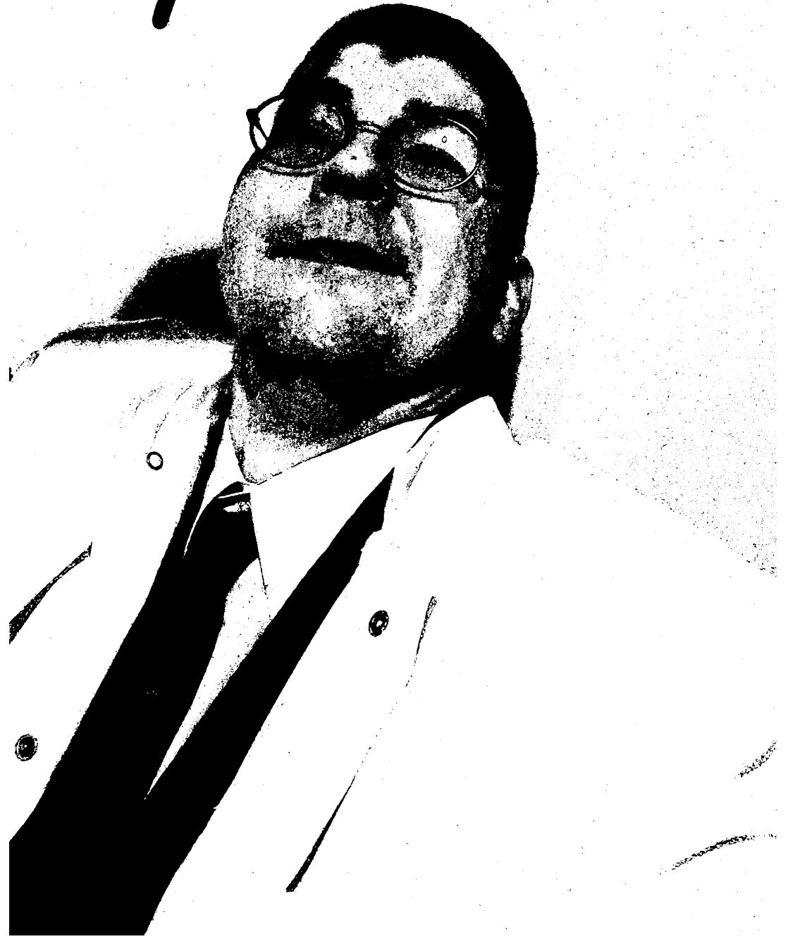
ARCHIV X (2015/2016): APOTHEUS RIES® - SAMMLUNG RIESCHEN TEIL I/III